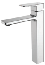
Extended Basin Mixer