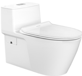
One Piece Toilet L747 x W385 x H634mm CL20075-6DACTCBT (S-trap 305mm) CL20075-6DACTPTT (P-trap 190mm)