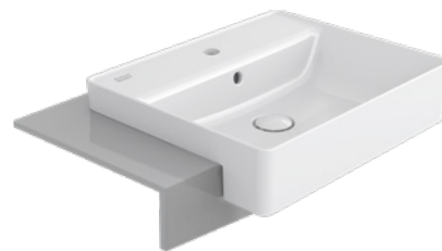
Semi Counter (Single hole) L380 x W550 x H125mm CCASF419-1010411FO