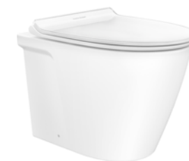
Back To Wall Toilet L555 x W376 x H390mm CL32297-6DACTCBB