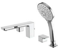
Deck Mount Bath & Shower Mixer