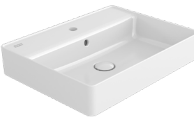
Vessel with Deck (Single hole) L450 x W600 x H110mm CCASF420-1010411FO