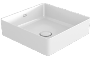
Square Vessel L420 x W420 x H110mm CCASF411-1000410FO