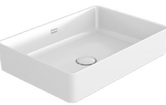
Vessel L380 x W550 x H110mm CCASF412-1000410FO