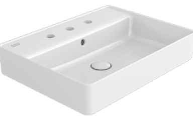
Vessel with Deck (8 inch 3 hole) L450 x W600 x H110mm CCASF420-1080411FO