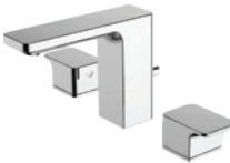
3-Hole Basin Mixer