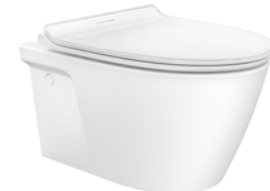
Wall Hung Toilet L555 x W376 x H360mm CL31197-6DACTPTB