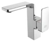
High Spout Basin Mixer