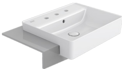
Semi Counter (8 inch 3 hole) L380 x W550 x H125mm CCASF419-1080411FO