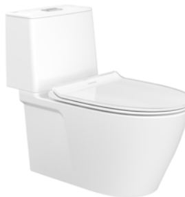
Close Coupled Toilet L741 x W385 x H741mm CL23075-6DACTCBT (S-trap 305mm) CL23075-6DACTPTT (P-trap 190mm)