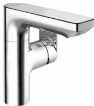
Deck-Mount Pull-Out Basin Mixer